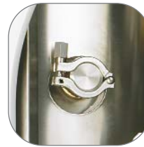
Connection for testing and validation