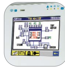
Graphic synoptic display