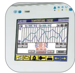
Graphic cycle display