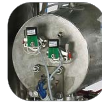
Separate steam generator