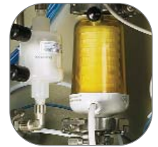
Decontamination of exhaust air with sterile filter