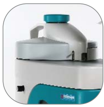
Lid detail with protective thermal cover